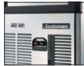
Front ON-OFF Switch