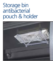
Storage bin antibacterial pouch & holder