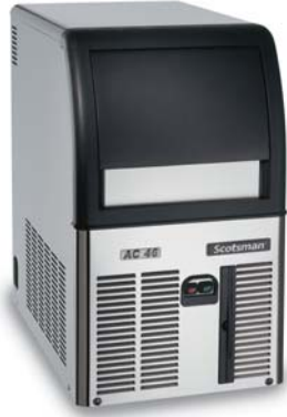
Routine Maintenance Alarm